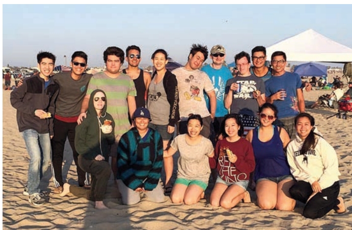
Bonfire at Huntington Beach