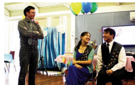
Giving speeches during the pinning ceremony