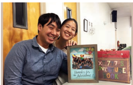
Adventure Book and shadow box