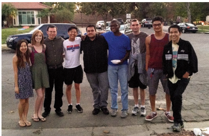
4th of July!

gift card, and a shadowbox. We wanted to thank them for their dedication to the group for the past 10 years, and we all had a wonderful time appreciating them! Currently, we are starting to plan for our annual Ext.777 Sunday on October 16! We are looking forward to what God will teach us through the end of the year, and we are praying for you too, our church family. :) †