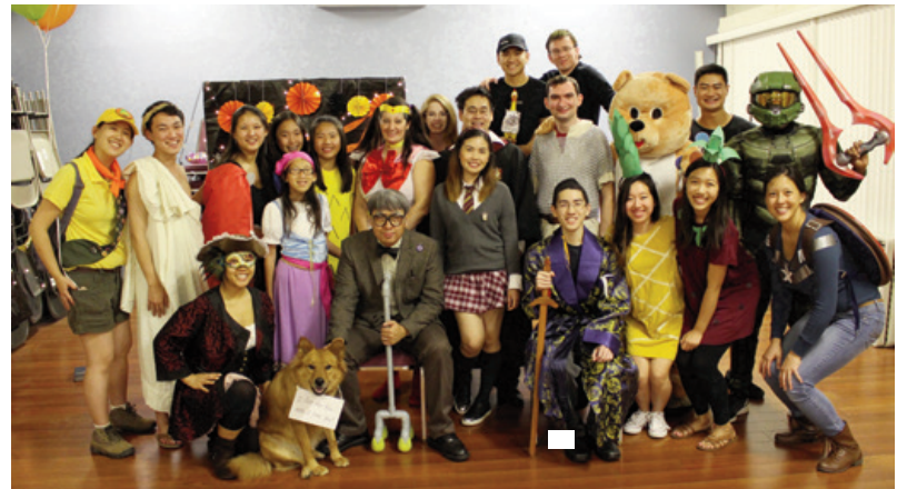
Halloween Costume Party