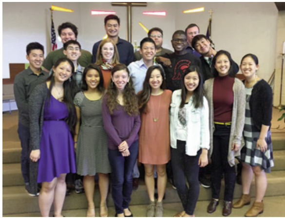
Ext. 777 Sunday!

Currently, we are going through the book of Colossians, and we still have a few more events left this year! Please keep our leadership team and our group in prayer. God bless! †