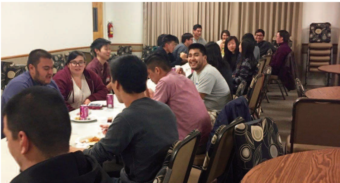
Our Friendsgiving banquet table!