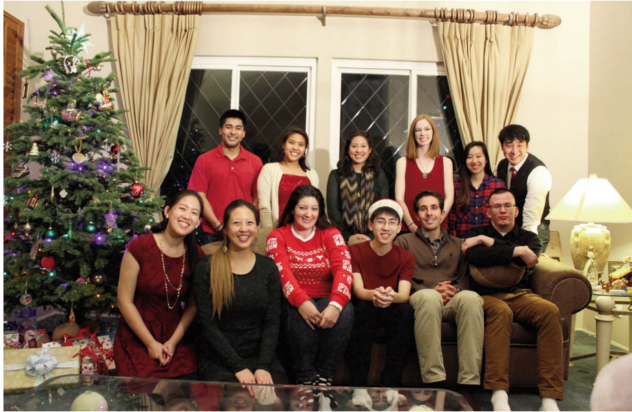
The Young Adult group enjoyed a festive cocktail party together to celebrate Christmas!

Jesus comes not for the super-spiritual but for the wobbly and the weak-kneed who know they don't have it all together, and who are not too proud to accept the handout of amazing grace. – Brennan Manning, The Ragamuffin Gospel .