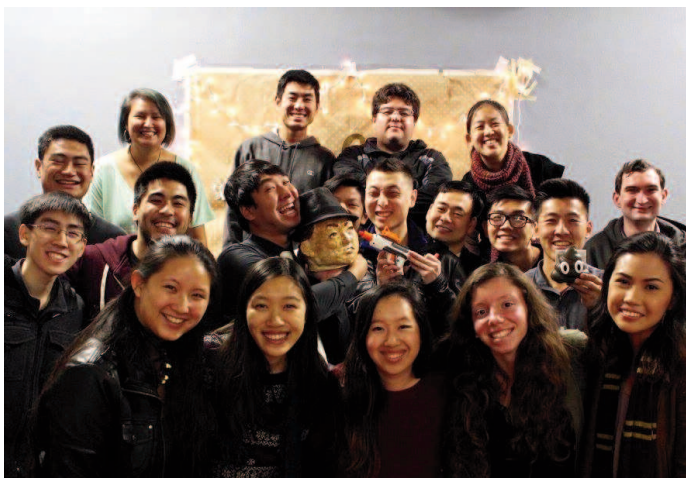
Annual Christmas Party!