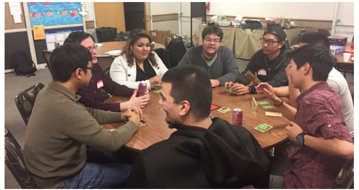
Getting ready to play a group game!