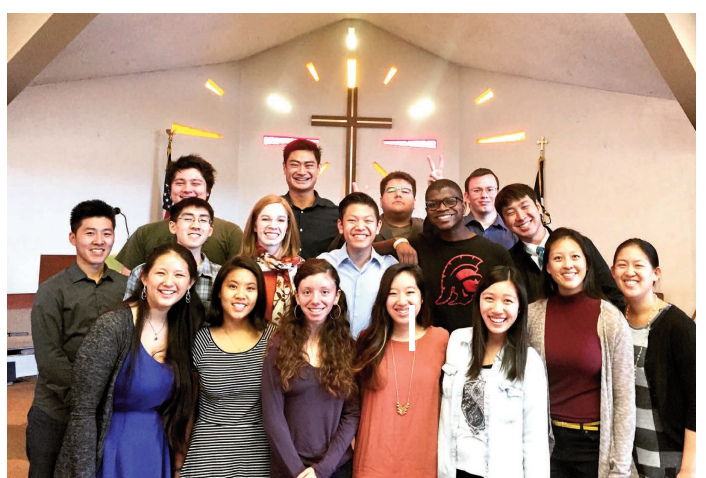
Ext 777 Group