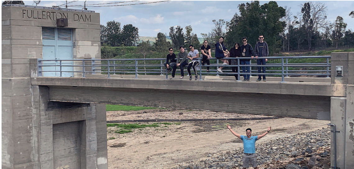
Giant Craig Park