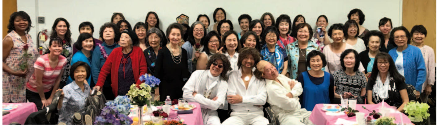
Our Mothers with the Beeg Cheese