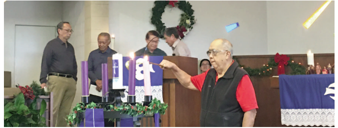
December 8th - PEACE - New Life