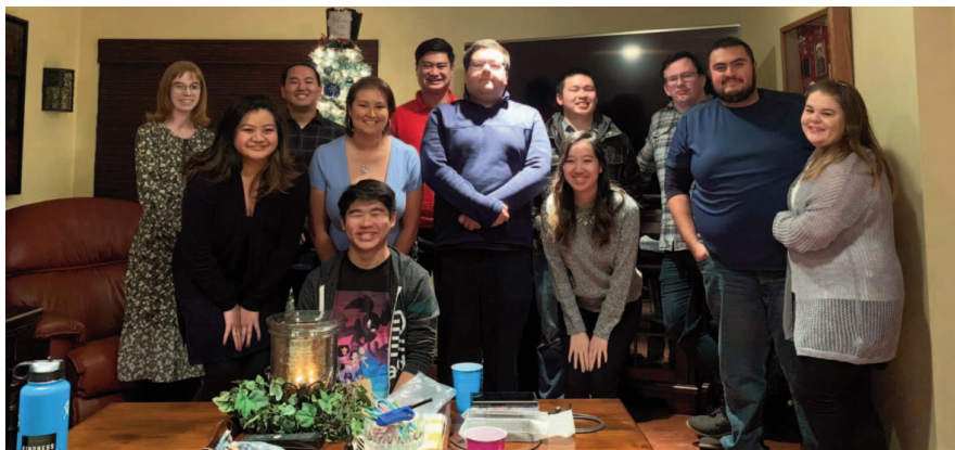
New Year's Eve