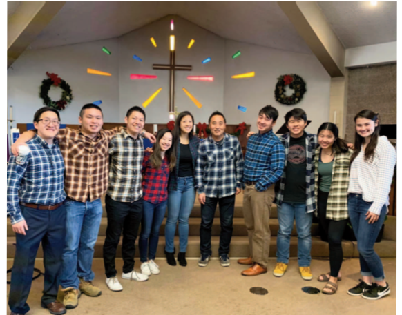
Plaid Worship Service helpers