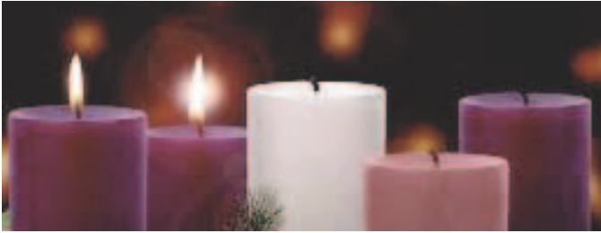
December 1st- HOPE - HUGS

Advent Season celebrates the arrival of Jesus!