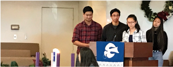
December 15th - JOY - AM/PM