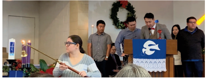
December 22nd - LOVE - EXTRA