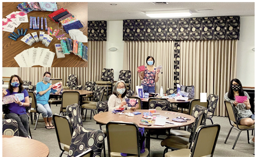
Missions - (Cont'd on pg. 2)