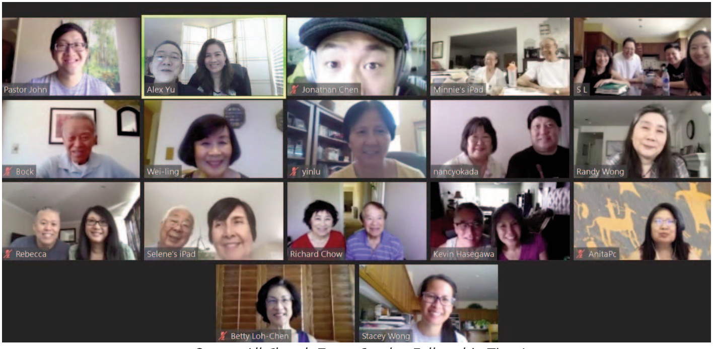
Our 1st All Church Zoom Sunday Fellowship Time!