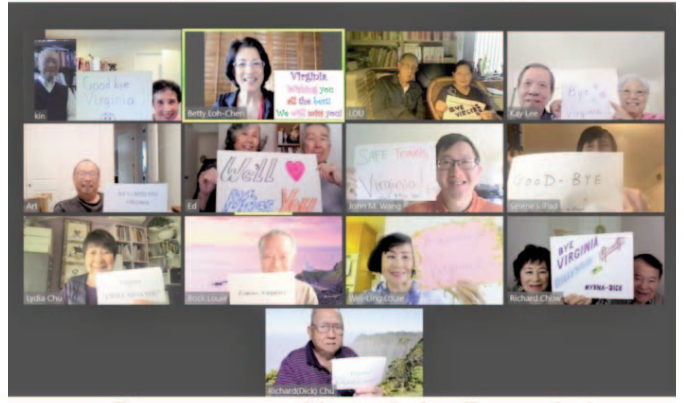
From your New Life Friends!