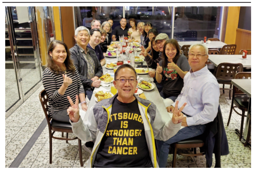
Fun, Fun, Fun Friday Night Dinner! Ruby's Diner in Brea