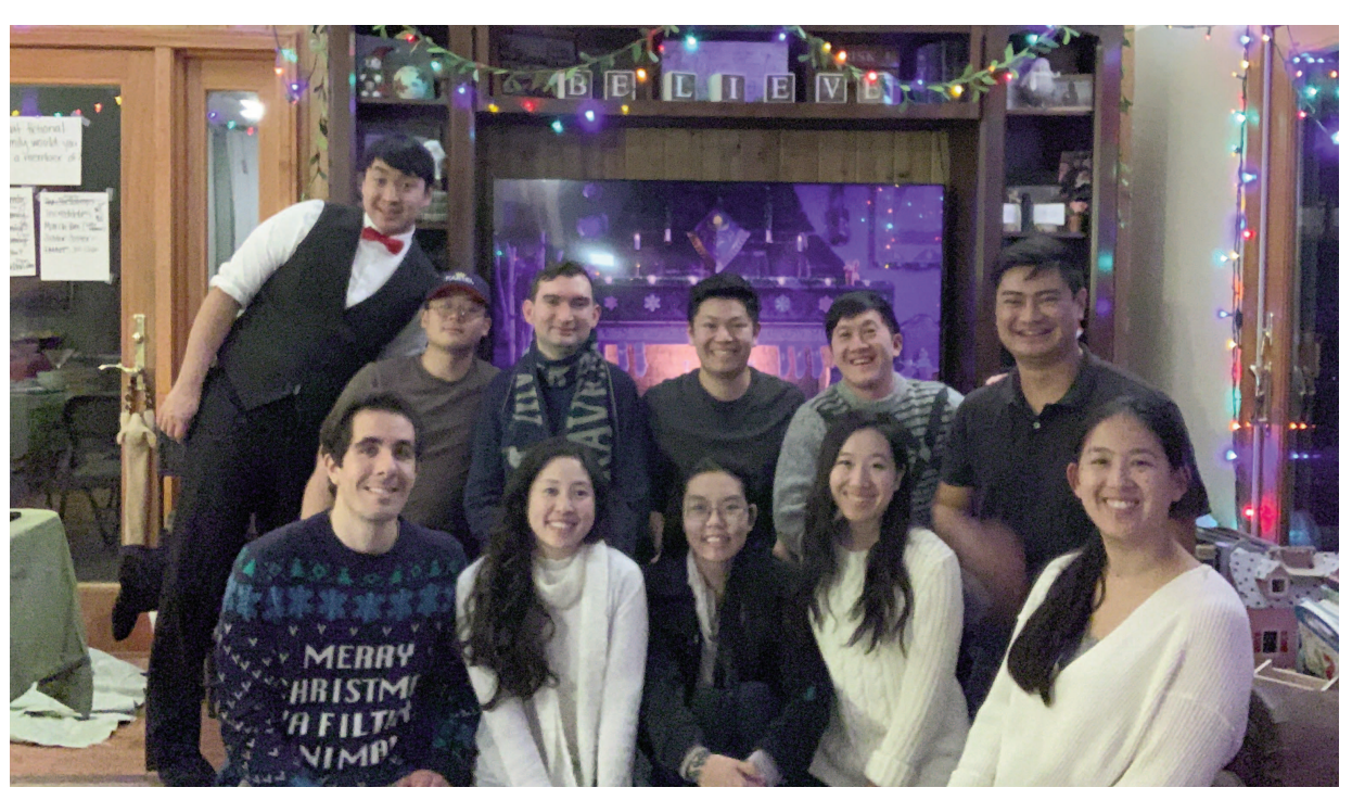
Christmas Cocktail Party on December 16, 2021