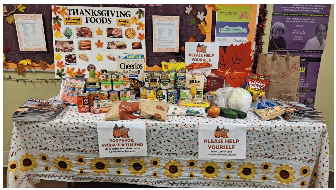
Food Drive at the Satellite Healthcare Center